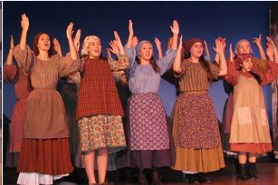
Musical Production – MacArthur Fiddler on the Roof