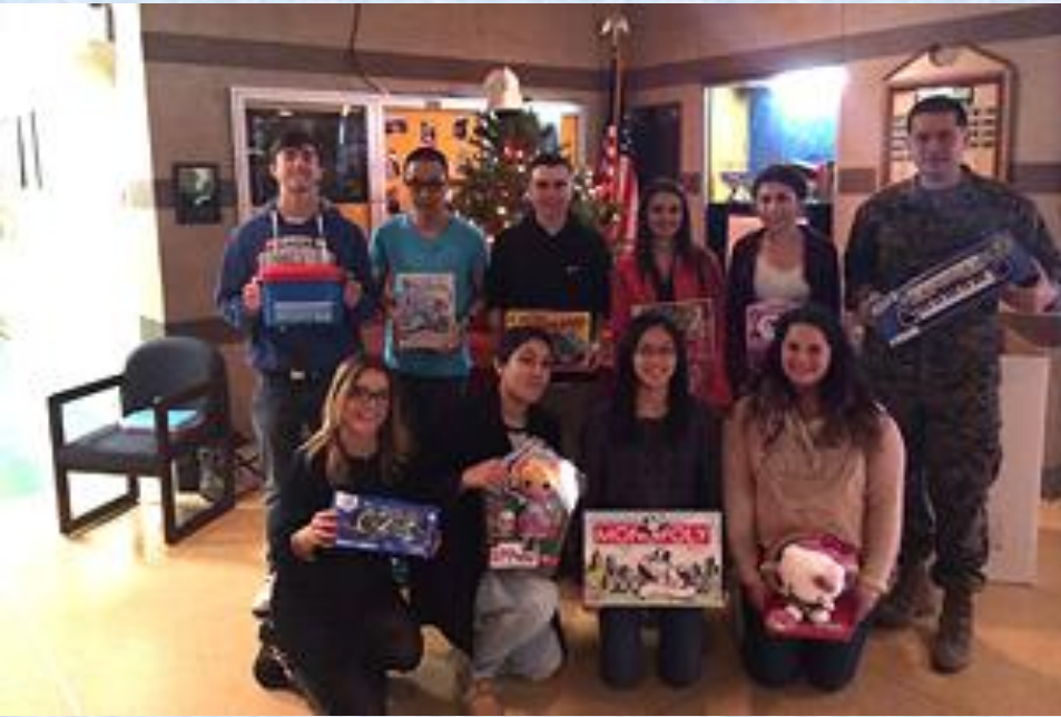
Business Honor Society – Division Toys for Tots event