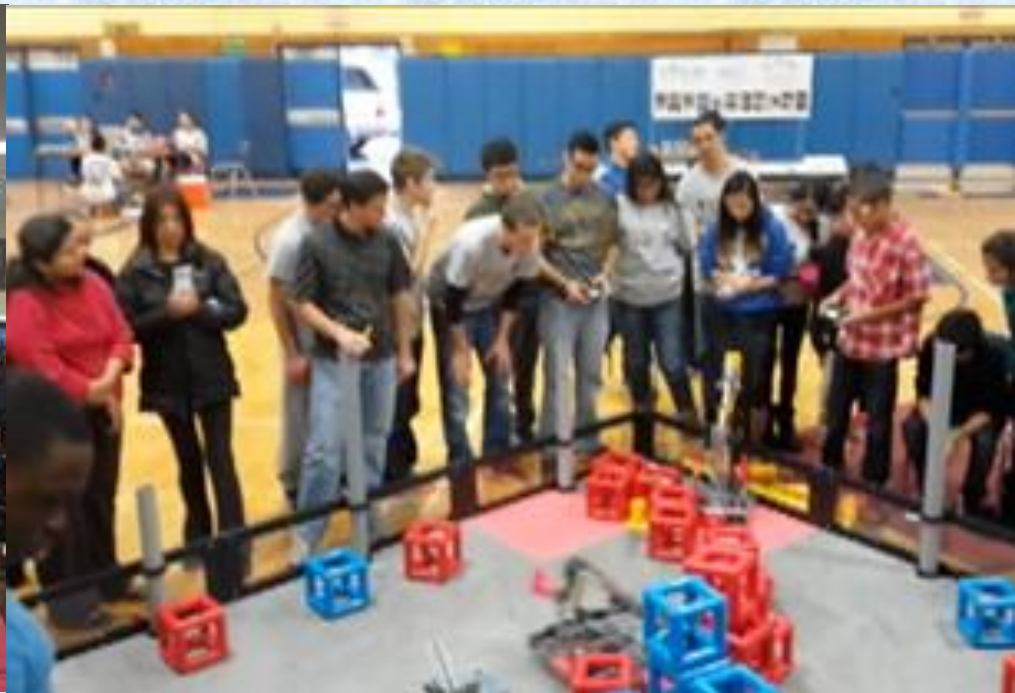
Robotics Club – Wisdom VEX Robotics Competition