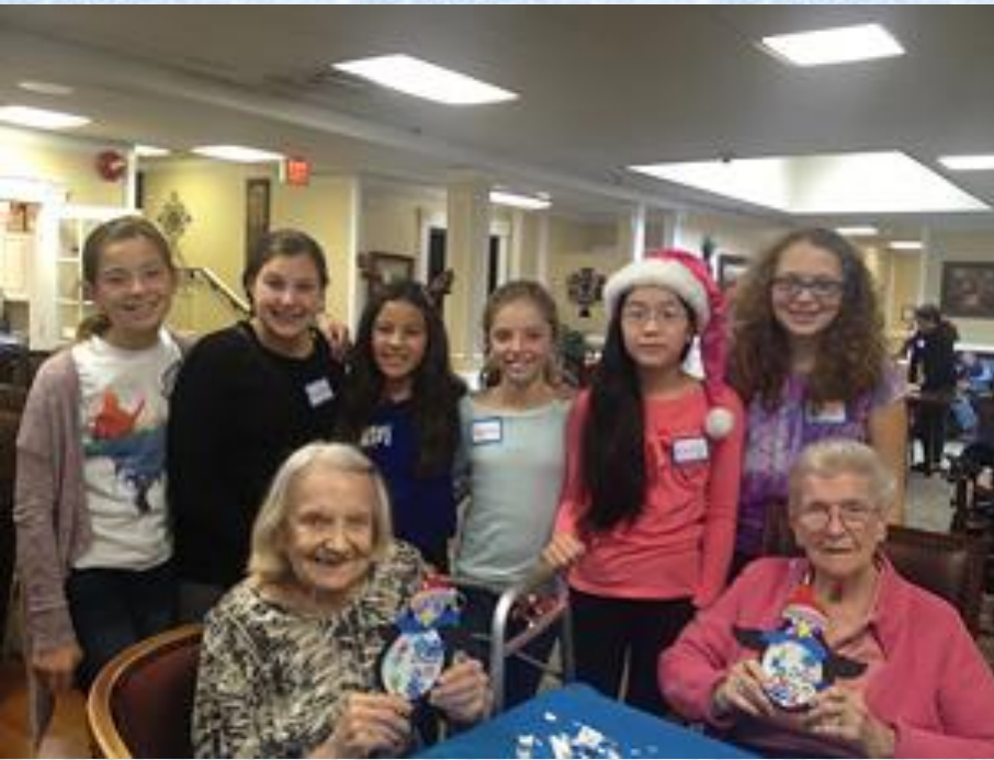
Connections Club – Salk Visit to the Arbors Assisted Living Facility